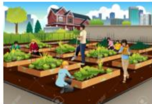
School Community Garden

Including a fridge, lounge and kitchen bench